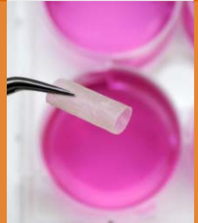
Collagen Bio Tubes for cell growth at in- or outside of the tube wall

© Viscofan BioEngineering | REVISION DATE: 16-03-2022