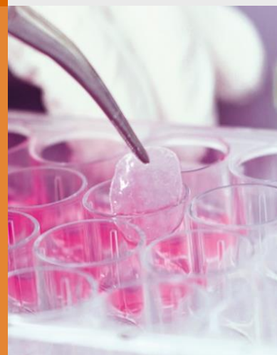
Transferrable CCC for multiwell plates

The CCC is delivered dry, sterile and individually packed. Before cell seeding, it needs to be attached (reversibly) to the bottom of a cell culture-treated vessel. To ensure proper adhesion, follow our easy User Guide with no need for any auxiliary compound.